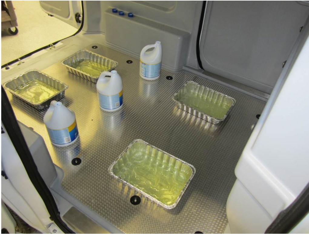
Photograph 3: Bleach Placement