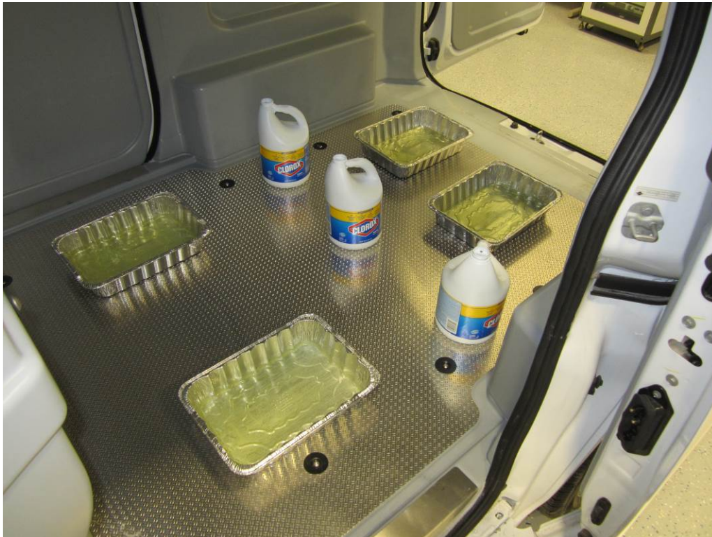
Photograph 2: Bleach Placement