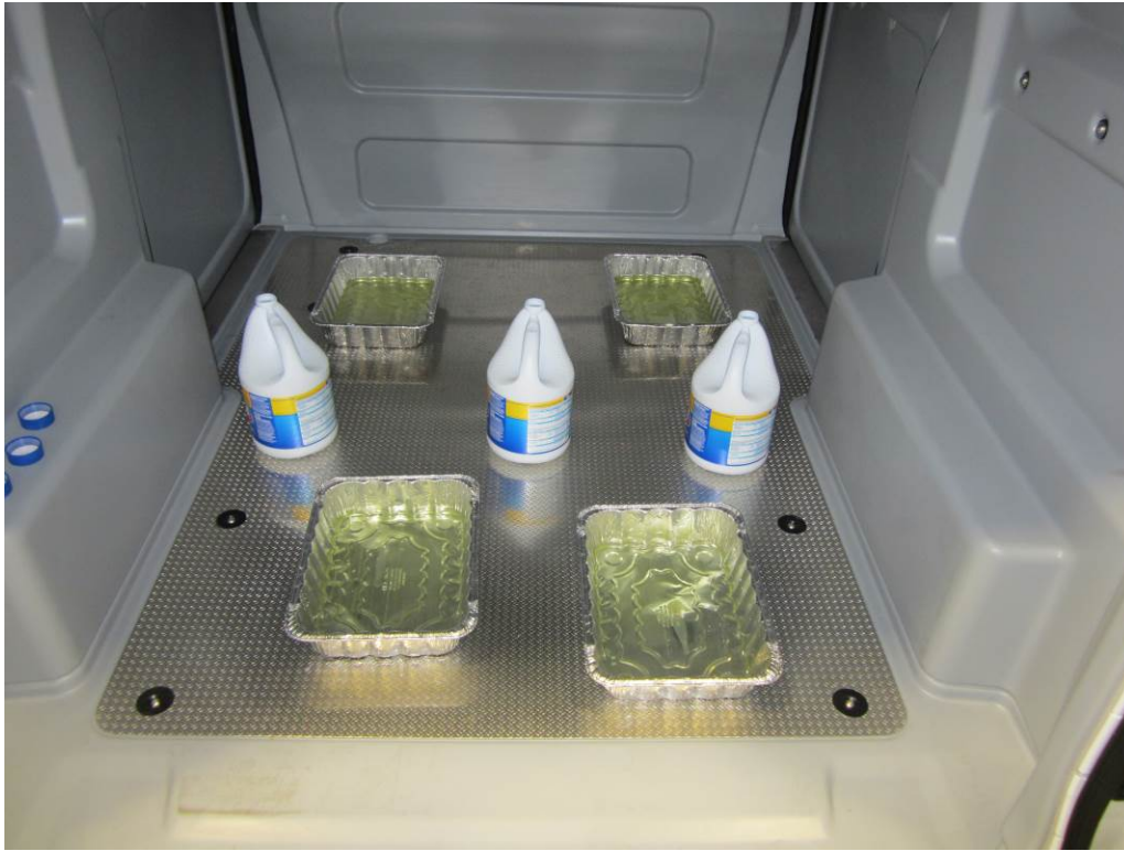
Photograph 1: Bleach Placement