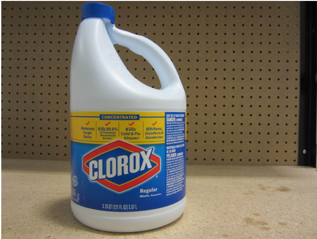
Photograph 4: Bleach