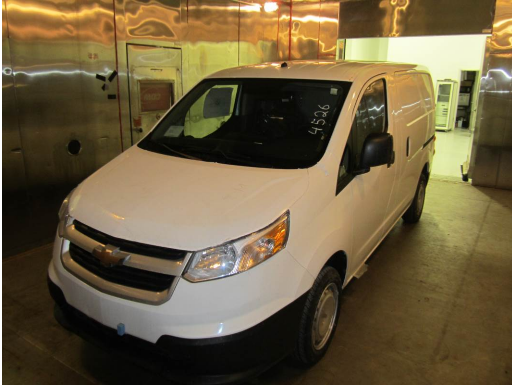
Photograph 5: Vehicle in Chamber