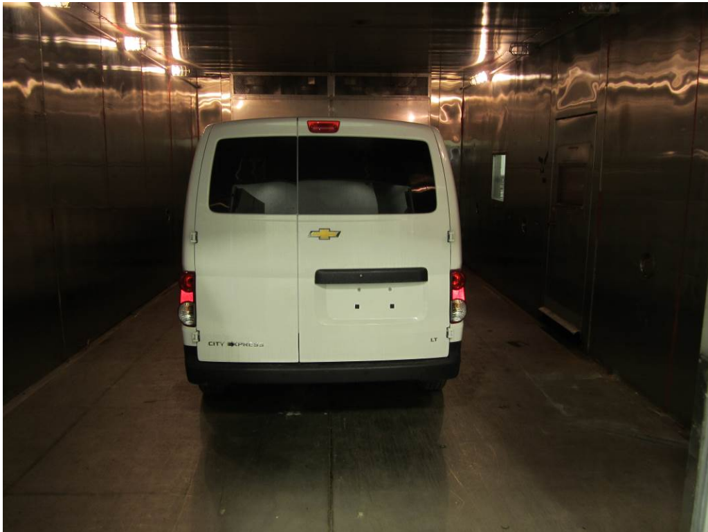
Photograph 6: Vehicle in Chamber